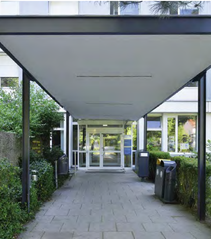
OEI Eingang